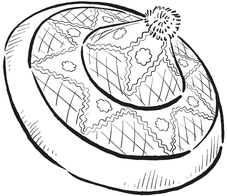
JAAPI (JAH-PEE) OF THE ASSAMESE PEOPLE IN INDIA